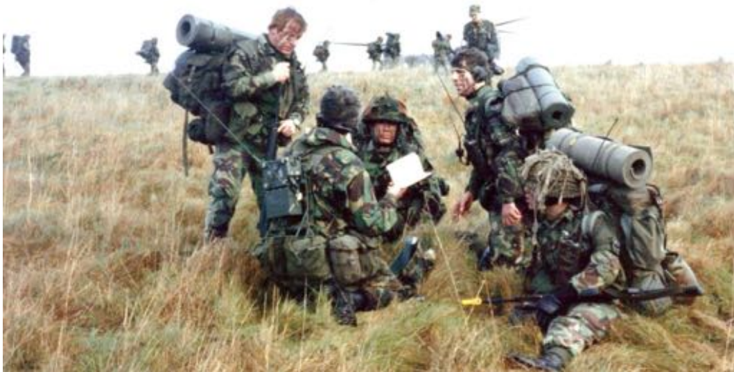
Ex Cold Start in 1989 with a Chinook in the background

Military training was also undertaken frequently. This involved deployment drills, camouflage drills, weapon training, minor tactics and Nuclear, Biological and Chemical (NBC) drills.