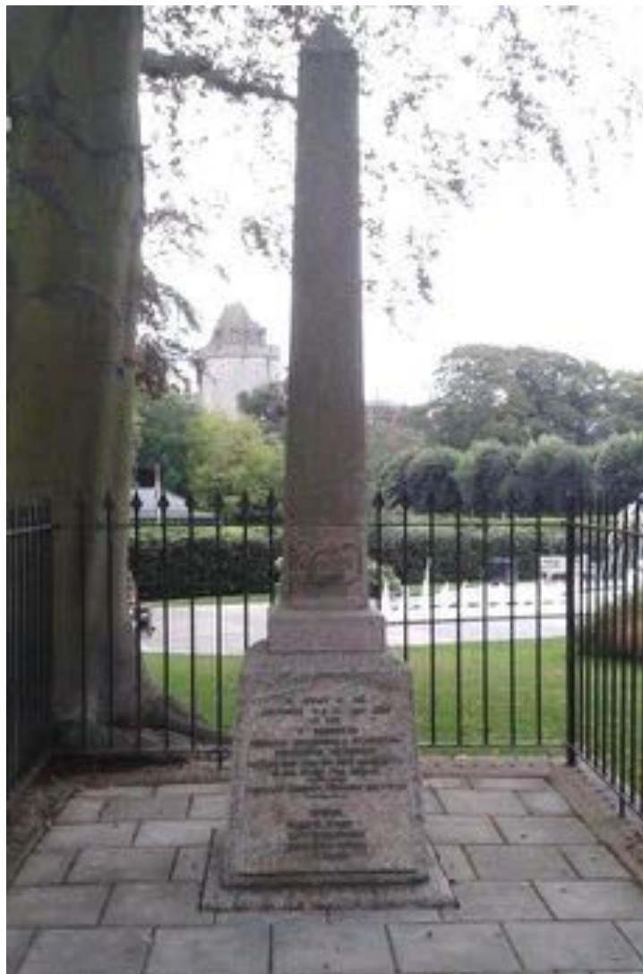
Memorial in Windsor dedicated to members of ‘A’ Squadron, Berkshire Yeomanry

“They shall grow not old, as we that are left grow old: Age shall not weary them, nor the years condemn. At the going down of the sun and in the morning we will remember them.”