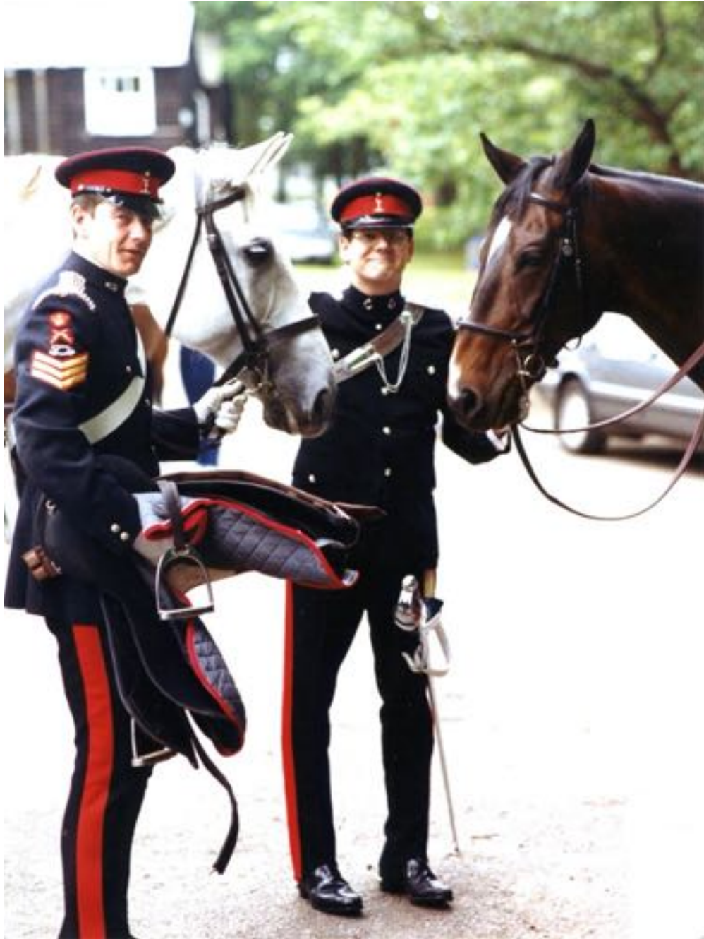
Sqn members demonstrating their equitation skills in 1986