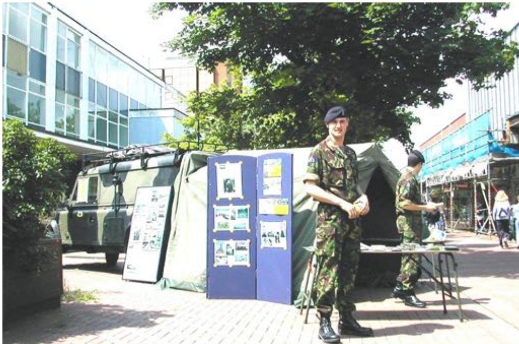
A recruiting stand in Reading town centre

During its early years the Squadron had an establishment of 12 officers and 140 soldiers and, with three TA Centres, was often fully recruited. However it was clear that recruiting was a non-stop process and considerable effort was expended in local advertising, attending local events, and leaflet drops. Today the current establishment is 5 officers and 109 soldiers, a considerable reduction particularly in officer strength. Between 2010 and 2012 the Army reduced the resources available for recruiting for the Reserve and this led to significant falls in the strength of many Reserve regiments. Fortunately this trend has been reversed and focused efforts at Squadron and Regimental level are beginning to show improvements in recruiting and retention.