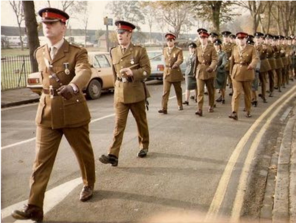
Remembrance Parade Windsor in 1984 in No 2 Dress

From 1969 onwards the Squadron continued to hold Remembrance Sunday parades in the centre of Windsor where the Regimental memorial to members of A (Windsor) Squadron, Berkshire Yeomanry, was erected in 1925. The site of this memorial had originally been close to the TA Centre (at that time in Windsor High Street and from 1949 in Clewer Mead) but in 1963 a new TA Centre was opened in Bolton Road, some two miles away, and thereafter it became necessary to transport the troops to the Town Centre for the Parade.