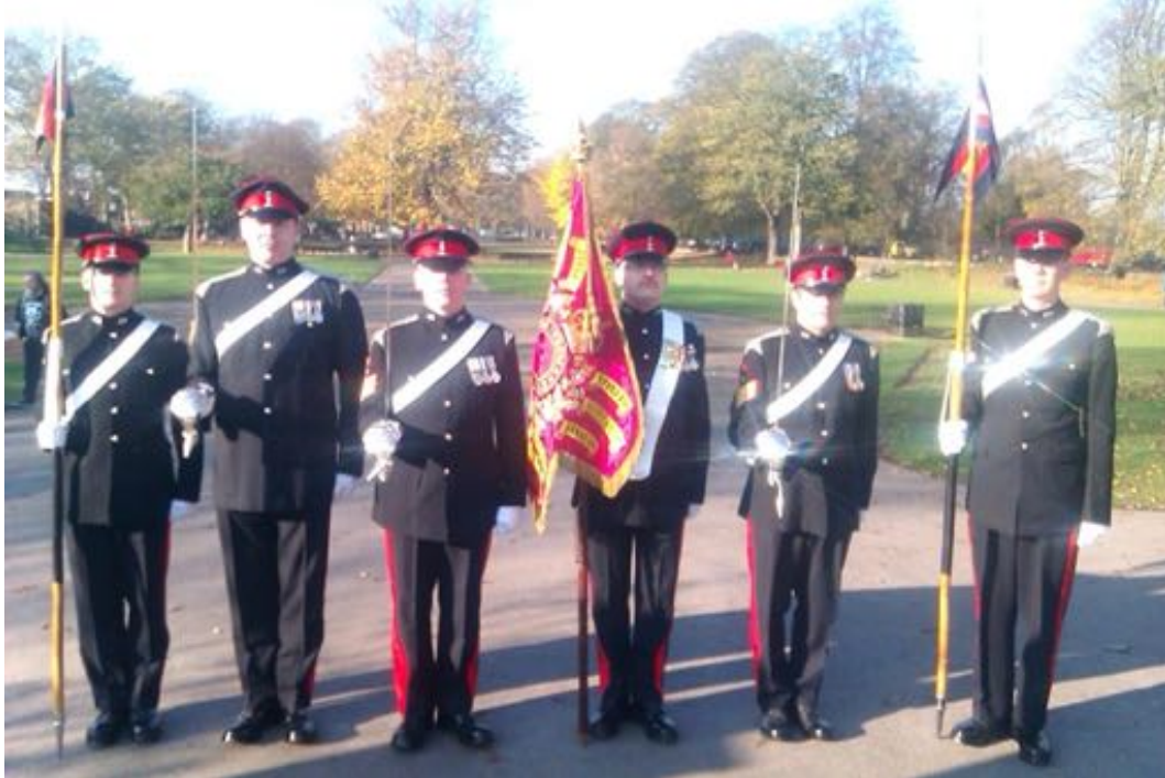
Guidon Party and Lance Guard November 2011