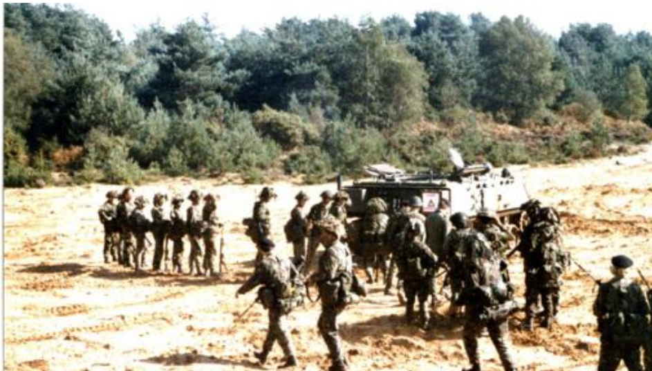
Annual Camp 1989 deploying in Armoured Personnel Carriers

The Brigade-wide communications exercise “Ex Red Shoes”, held every second year, added impetus to the communications training and in the intervening years emphasis was placed on military skills and adventure training. Ex Red Shoes was sometimes subsumed into nationwide Home defence exercises which would involve establishing AFHQs, SRHQs and county-based brigade-level HQs or Tactical Areas of Responsibility (TAORs) and the deployment of extensive ground forces.