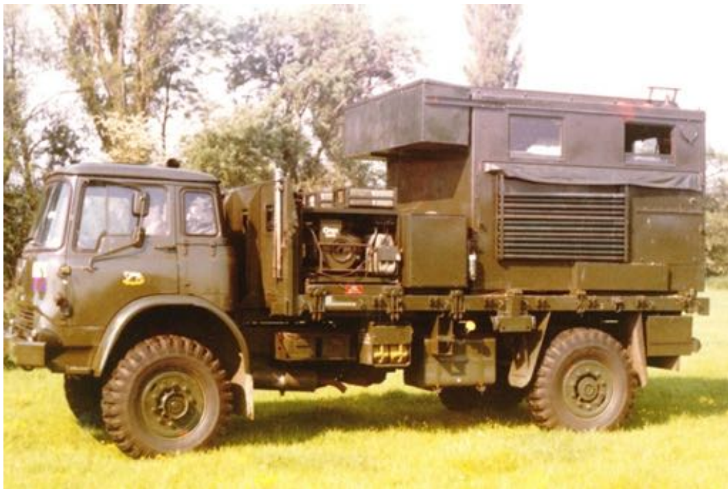
Bedford MK box body fitted with D11/R234 and generator

The Cold War was at its height and Squadron's primary role was to provide communications for Military Home Defence particularly in the event of Nuclear War. For Home Defence, the UK was divided into ten regions and No 6 Region had its Armed Forces Headquarters, known as 6 AFHQ, based in Aldershot. The Squadron's role was to provide 6 AFHQ with post-nuclear-strike communications and, to do so, it was equipped with (i) high power long-range High Frequency (HF) radios providing Control-by-Radio (CONRAD) communications from 6 AFHQ to various Government agencies and other AFHQs, via relay stations known as Gateways, and direct to its two sub-regional HQs (SRHQs), and (ii) shorter range HF Larkspur radios for communications within the sub-regions. At that time, given the comparable resilience to electro-magnetic interference, HF systems were regarded as more survivable than Very High Frequency (VHF) and Ultra High Frequency (UHF) systems in the circumstances of Nuclear War.