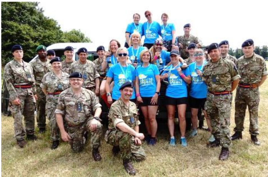
The Squadron supporting Beat the Boat event in Windsor