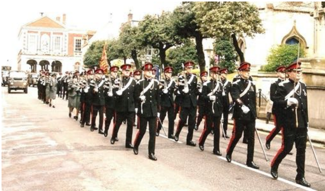
Windsor Freedom Parade in 1994