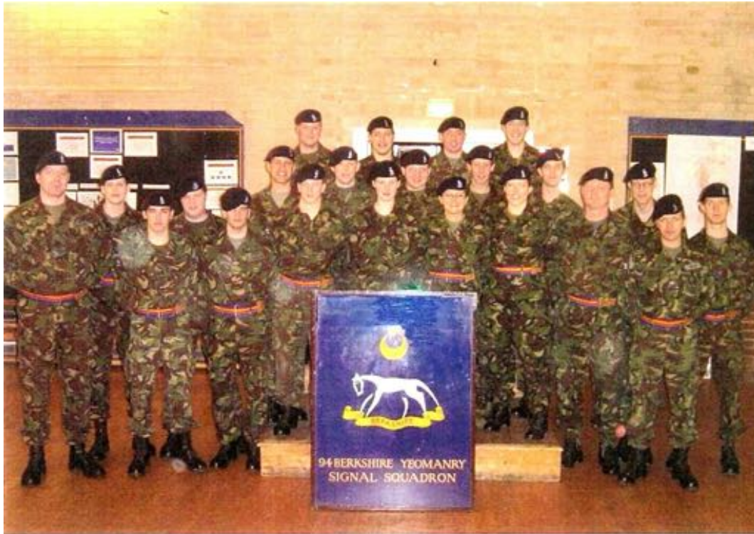
Berkshire Yeomen selected for mobilisation in 2003

In 2003, faced by the perceived threat of Weapons of Mass Destruction and the added uncertainty in the war against terrorism, the USA and its allies decided to invade Iraq. Deployment commenced in January 2003 with combined forces of 195,000 from the United States, United Kingdom, and other countries.