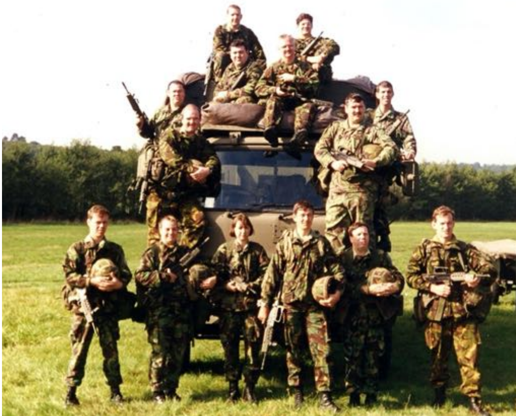
Squadron Headquarters in 1995: in its independent role SHQ needed to be much larger