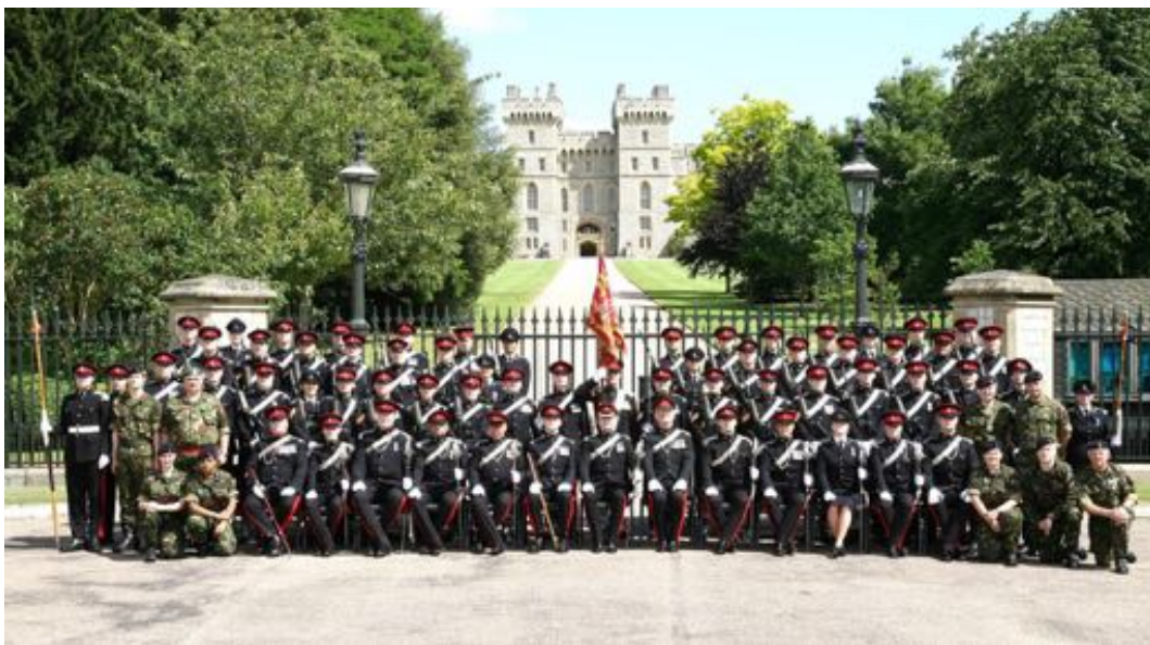
Freedom Parade Windsor 2008 to mark the 100 th anniversary of the formation of the TA