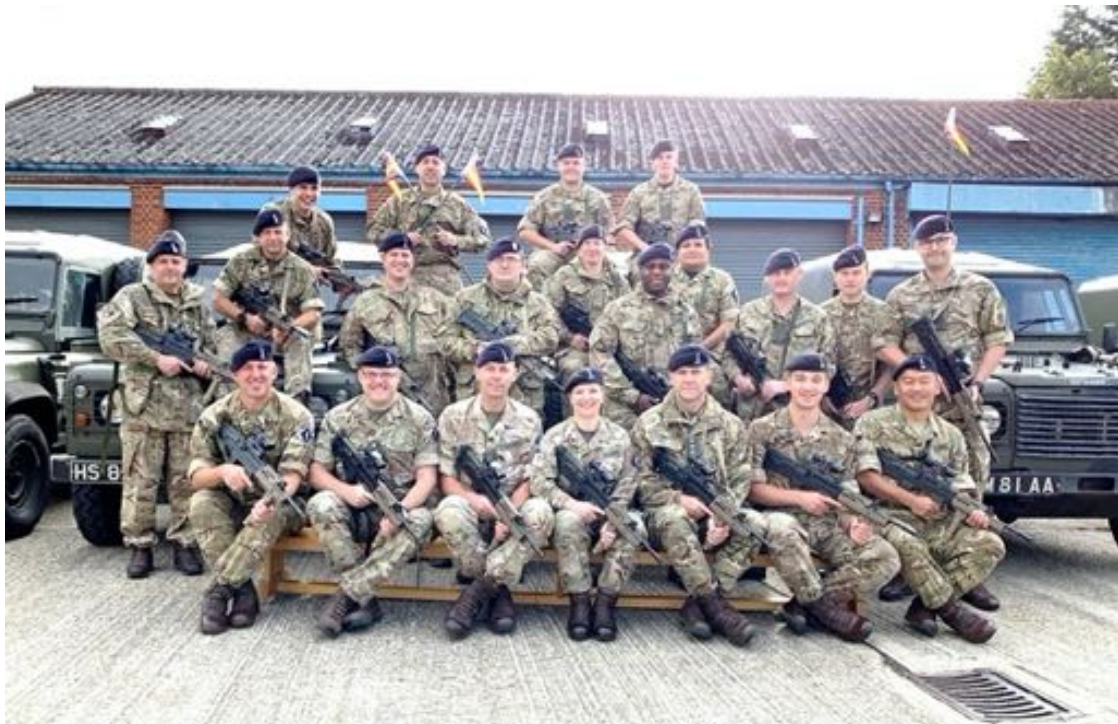
Main Party at Windsor prior to deployment

At the time of publication, the Squadron has recently returned from deploying with all Squadron Communications Assets on Ex JAVELIN ASSURE 6 th -21 st September 2019. This is a Brigade level Communications Exercise which included a Change of Command with 32 Signal Regiment in order to maintain the Corps WAN. More on that in the next Journal.