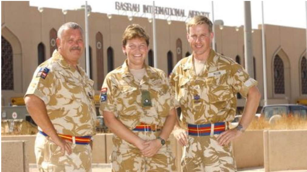
Op Telic 2: in Basra in September 2003

The deployment of UK forces, called Operation Telic, included 6,000 reservists mostly from the TA and was the first such mobilization of the TA since the Second World War. At one stage reservists constituted 28% of UK forces in theatre. Twenty-one soldiers from the Squadron were mobilised and deployed on the first phase and simultaneously four more were deployed on Operation Oculus in Kosovo. A further four were deployed later in 2003 on Operation Telic 2, the start of many similar deployments in subsequent years.