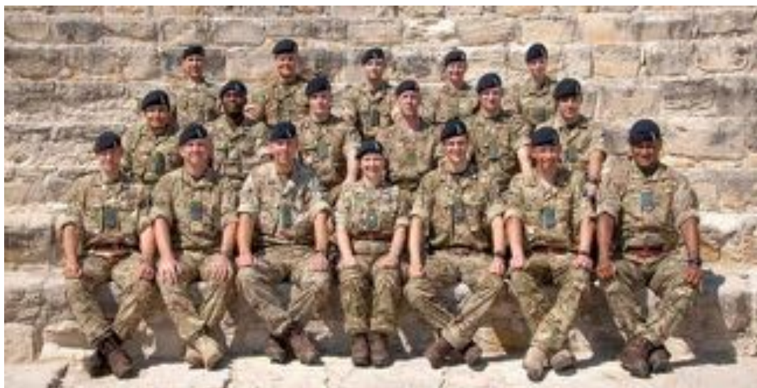
Annual Camp in Cyprus in 2018