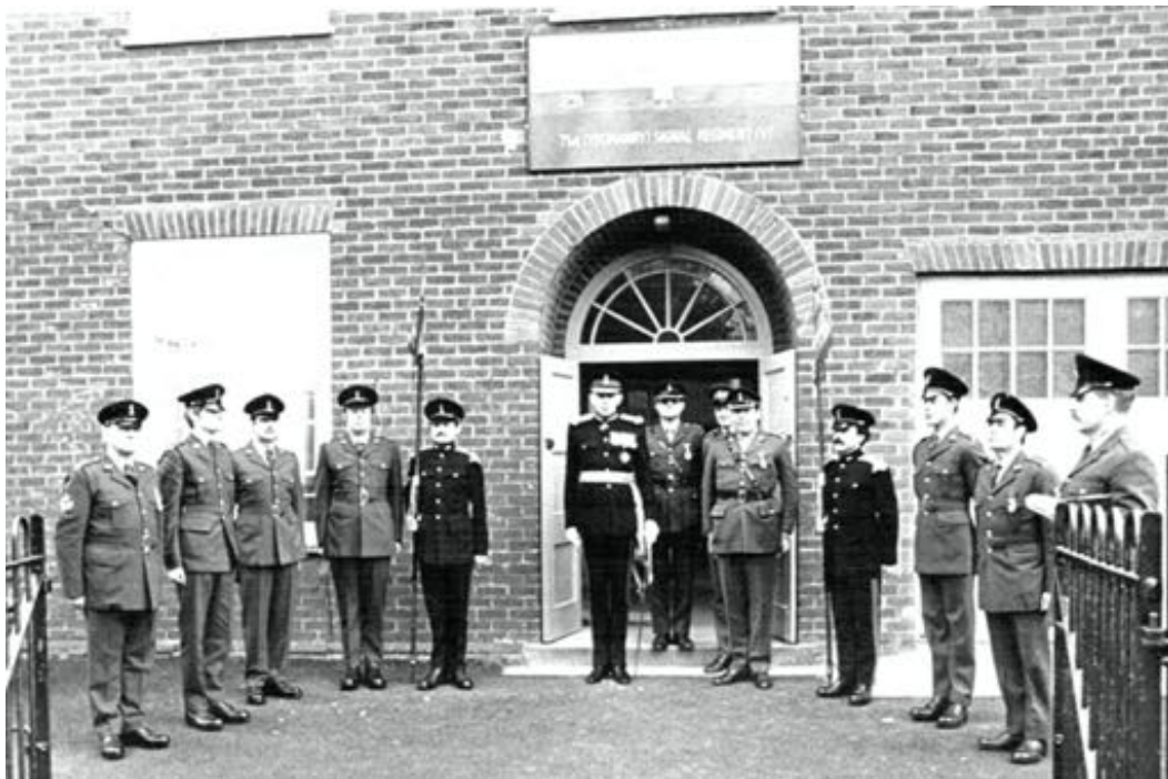
The opening of Chertsey TA Centre in 1977

In 1977 a past Berkshire Yeomanry association with Chertsey was rekindled with the re-opening of the TA Centre there and in 1978 this became the home for 886 Signal Troop. In addition, in order to meet an additional role within CONRAD for long range communications, a new troop was established at Windsor, designated C2 Troop. This additional role was phased out in 1987.