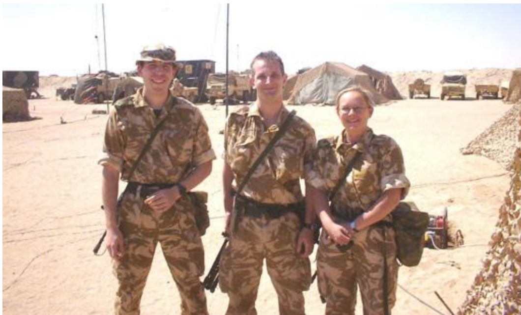
On Operations in Kuwait in 2003

In 2003, faced by the perceived threat of Weapons of Mass Destruction and the added uncertainty in the war against terrorism, the USA and its allies decided to invade Iraq. Deployment commenced in January 2003 with combined forces of 195,000 from the United States, United Kingdom, and other countries.