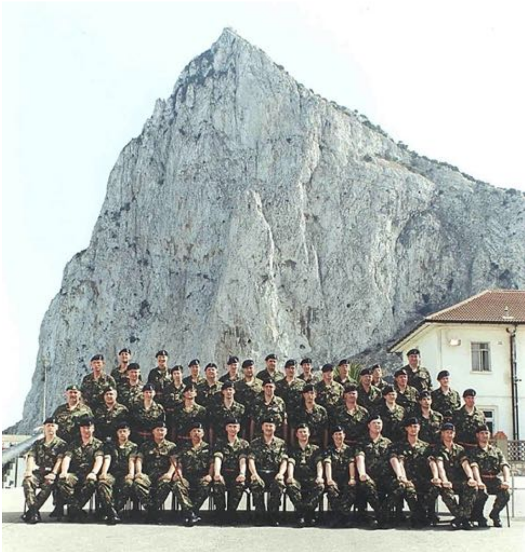
Gibraltar in 2003

In 2003, despite the absence of those mobilised on Operations, training continued and for June's Annual Camp forty-three Squadron personnel were transported by Hercules C130 aircraft to Gibraltar. Ex Marble Tor, supported by the Gibraltar Regiment, was a busy two weeks involving military training, such as OBUA (Operations in Built Up Areas) and FIT (Fighting in Tunnels). Activities included The Rock Run (running more than 4 kilometres to the top of the Rock), adventurous training and amphibious training.