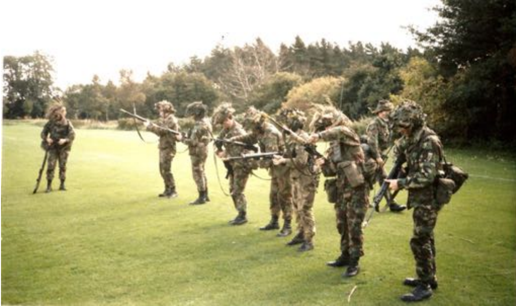
Annual Camp 1987: Preparing for FIBUA drills

For many years Annual Camp, a two-week period of continuous training, provided the main focus for the training programme each year. This was usually well-attended by all ranks with up to 90% of the Squadron deployed for 2 weeks.