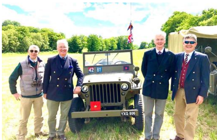
Members of the Association attending the D-Day 75 th Anniversary Celebrations in Normandy

As always the Association has had a busy year and on your behalf I should like to acknowledge the unceasing efforts of your Committee, all of whom were re-elected at the Annual General Meeting earlier this year.