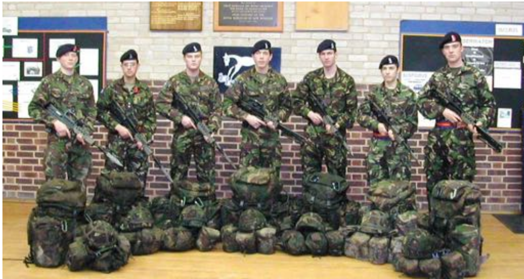
The Lanyard Trophy Team in 1990

71 (Yeomanry) Signal Regiment established a regimental shooting team in the 1970's. A pavilion in the grounds of the National Rifle Association at Bisley, nicknamed the Bisley Hut, became the shooting team's home. It was a substantial timber building and could sleep some 70 all ranks. The shooting team, administered by the Squadron, regularly trained at Bisley and the Squadron often provided more than half the team members. The team was often successful and won many awards at TA and Corps Skill-at-Arms Meetings. More recently, the Squadron has continued to provide individuals within the current Regimental Shooting team.