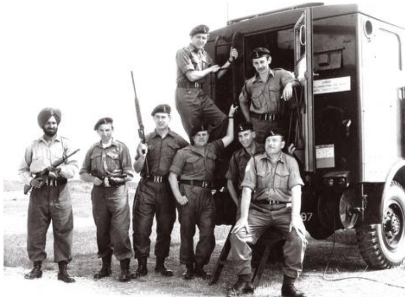
885 Troop in 1970 armed with SLRs and SMGs

From the outset soldiers were issued with either the standard 7.62mm Self Loading Rifle (SLR) or the Sterling 9mm sub-machine gun (SMG) depending on their Royal Signals trade. Officers were issued with the 9mm Browning L9A1 pistol. In addition each troop was equipped with the standard light machine gun (LMG). The development of these weapons dated back to the Second World War.