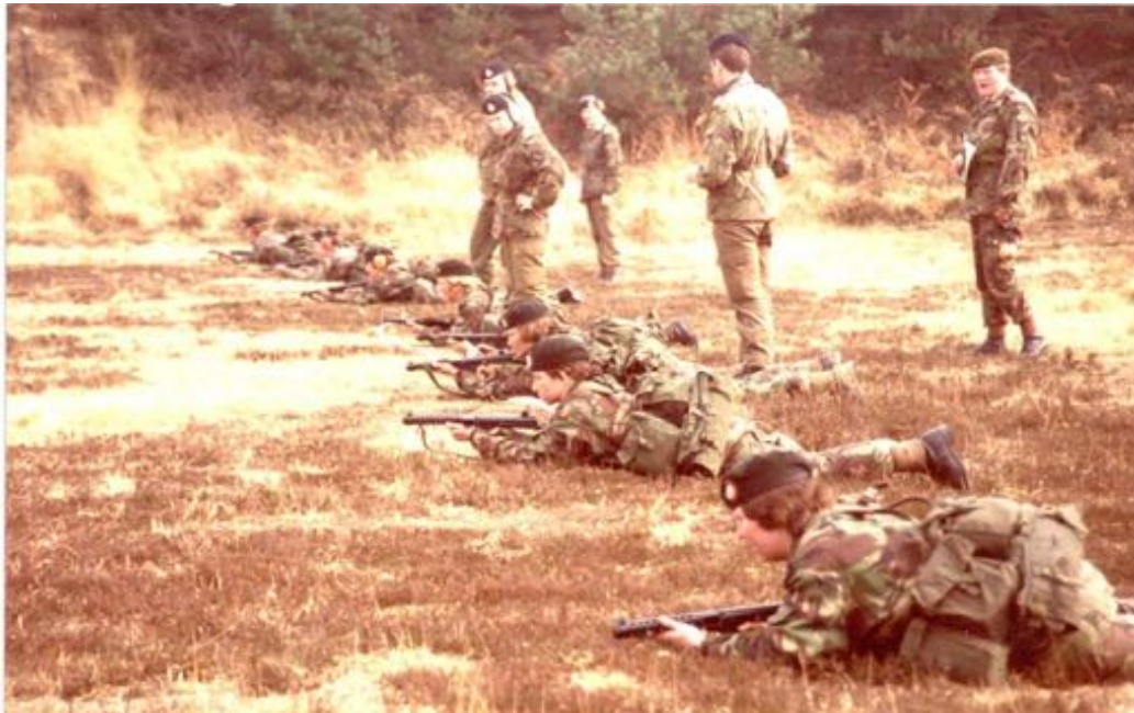
WRAC members of the Squadron on Pirbright Ranges c 1980

On formation in 1969 the Squadron's role entitled it to recruit and enlist female officers and soldiers. At that time all women attached to Royal Signals units served in the Women's Royal Army Corps (WRAC) and were uniformed and badged accordingly. They were not permitted to carry weapons and quite often their personal equipment was inferior in quality compared to their male counterparts. It was some years before this situation was rectified. The WRAC were fully integrated into Royal Signals in 1982.