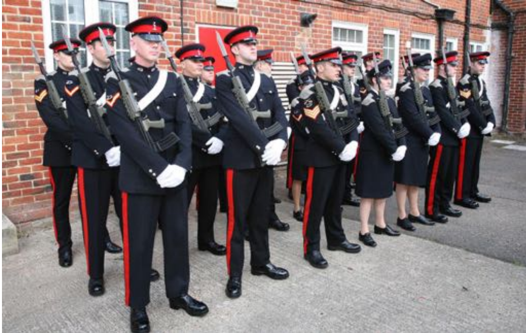
886 Troop in No 1 Dress with the SA80

In 2012 Future Army Dress (FAD) was introduced updating and replacing No 2 Dress but the issue to Reservists was again limited to SNCOs and those soldiers needing it for courses or ceremonial uses.