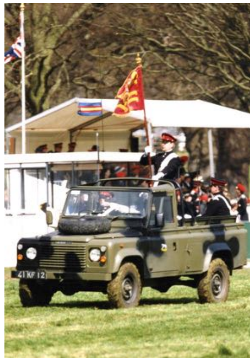
Royal Review - Windsor Great Park 1994

On 25 July 2009 the Squadron was honoured by the granting of the Freedom of Entry to the Borough of Runnymede in recognition of the close links between the Squadron and the town of Chertsey. The event was marked by a parade through the towns of Chertsey and Addlestone.