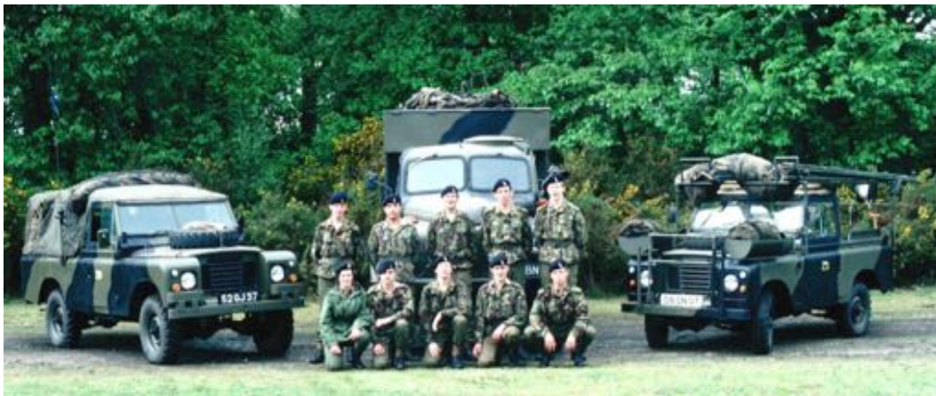
The radio and line detachments of SHQ Troop at Annual Camp in 1982