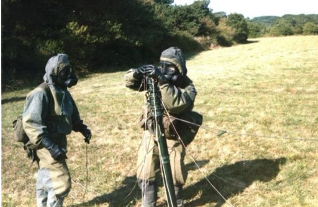
Comms drills in full NBC kit

Royal Signals recruit training had also become centralised and consisted of a number of preparatory weekends followed by a two-week course run by the Regular Army. From 1976 these courses were run at Catterick and in 2000 these were moved to Blandford. Since 2015 recruit courses for Reservists have been centralised across All Arms and take place at four designated Army depots.