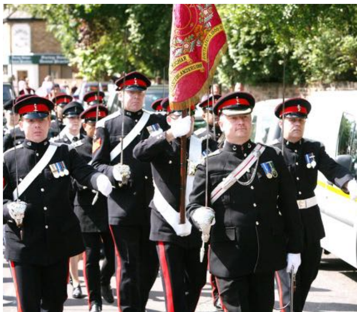
Runnymede Freedom Parade 2009

In the 1980's the Army decided to seek to establish closer links between the Regular Army and the Territorial Army and the "One Army" concept came into existence with much improved equipment levels for the TA as a whole and greater cooperation in training.