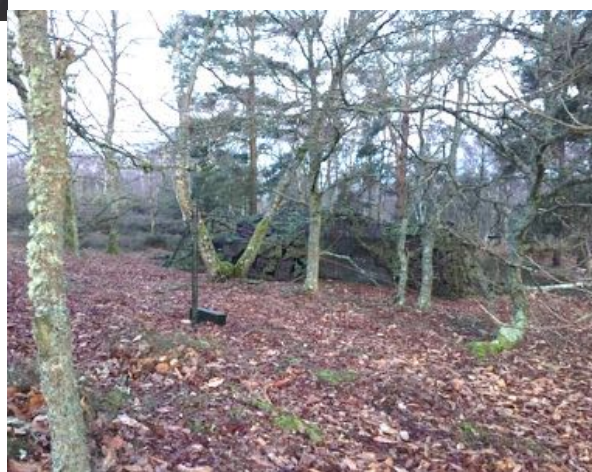
Back to basics Det Cam and concealment

On a cold, wet and windy weekend in January, the Squadron started getting "Back to - comms - Basics" in the Aldershot Training Area. Exercising on the new VHF upgraded platform, refreshing our concealment, voice procedure and military skills. With our focus over recent years being on UK ops, we had nearly forgotten how much fun could be had putting up Cam in webbing!