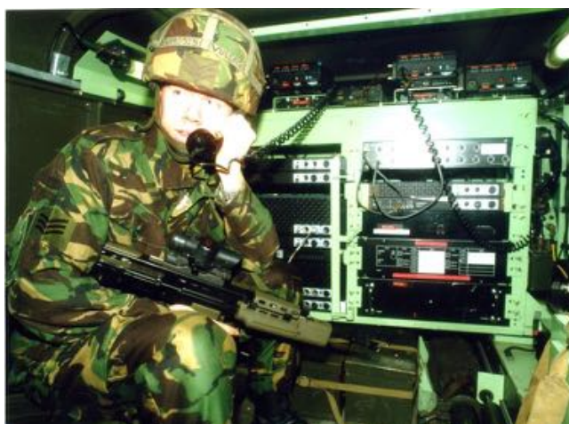
Landrover-borne MOULD station

By the mid 1980's it had become clear that the D11/R234 radio was reaching the end of its useful life, and the design and testing of a new system began. All D11/R234 equipment was back-loaded in 1987 and there followed a few lean years awaiting delivery of the new system. During this time the mainstay of the Squadron's communication training was the Clansman range of HF 320 (manpack) and 321 (vehicle-borne) radios, which had replaced the ageing Larkspur sets in 1984.