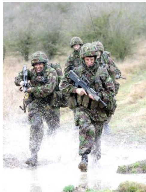
A patrol in Combat 95

Prior to the introduction of MTP the standard daytime working dress in the Army was known as barrack dress, distinguished by the use of the green heavy wool pullover in winter and shirt-sleeve order in summer. Squadron officers had the further distinction of wearing a blue pullover.