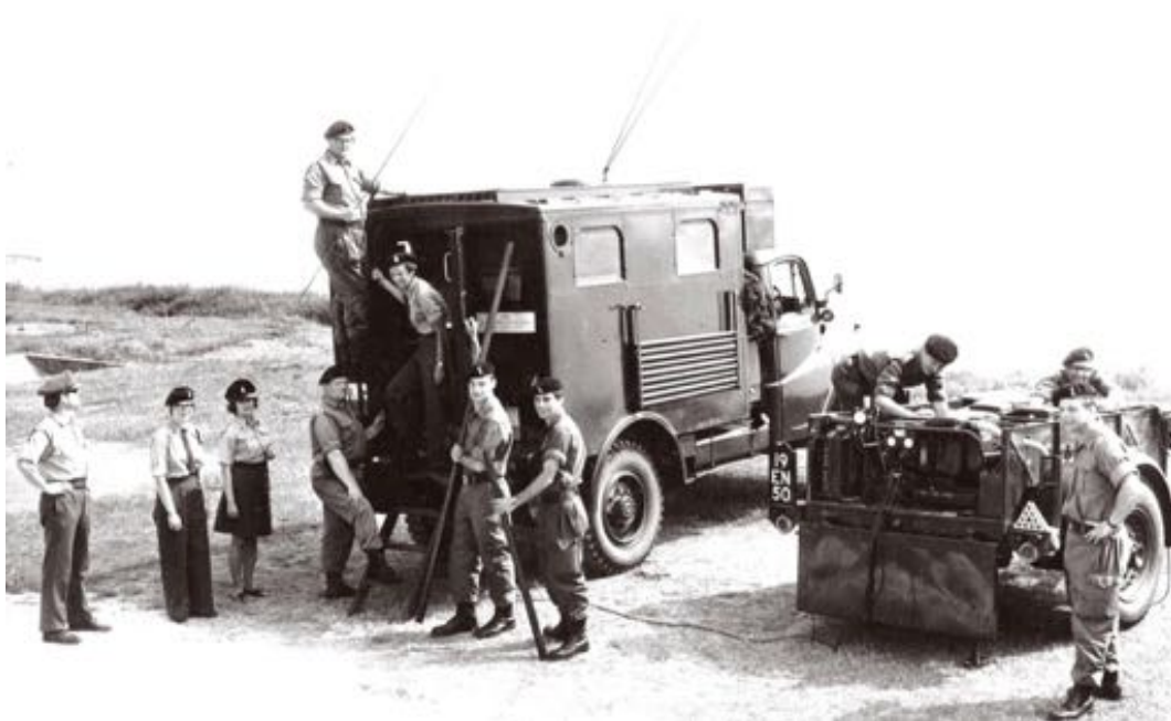
AFHQ Signal Troop at Scarborough Camp in 1970 deploying the generator-powered Larkspur D11 HF Radio mounted in an Austin K9 1-ton radio vehicle

In 1969 the Government of the day sought to reverse some of the more severe effects of its 1967 reorganisation of the TA and further changes saw the Berkshire Yeomanry re-roled from Infantry to Royal Signals. 94 (Berkshire Yeomanry) Signal Squadron was formed, sourced from the Royal Berkshire Territorial soldiers at Reading, Newbury and Windsor together with elements of Royal Signals units based at Southampton and Reading (including elements of 63 Signal Regiment which had been disbanded). The Squadron's troops were located at TA Centres in Reading, Southampton and Windsor.